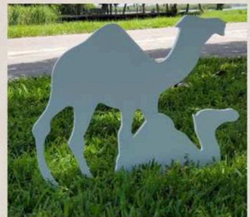
SMALL DOUBLE CAMEL