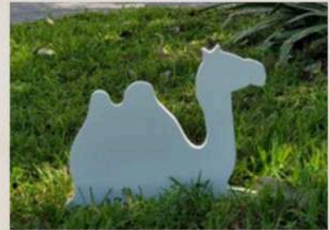
SMALL SINGLE CAMEL