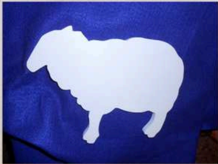
SMALL MAMA SHEEP